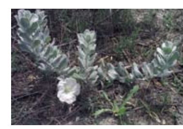
"Just admire it and think it belongs to this place, not to a glass of water!"

The name of the plant genus is derived from the Latin convolvere (to twine), a term that refers to the plant's climbing stem. It has a very long underground rhizome. The stem is about 50 cm high, velvety and greenish-white. The leaves are thick and big, velvety and covered with fine hair. The flowers are big, white and cup shaped.