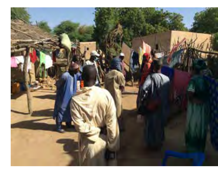
Explaining the importance of trees to local people and teaching them how to take care of the plants is a central task for the successful implementation of the project.

The tree plantations will be accompanied by educational activities to raise the local population 's awareness for the sustainable management of natural resources. The project team will continue to visit the villages regularly after the plantations, look after the trees and support the villagers in taking care of them.