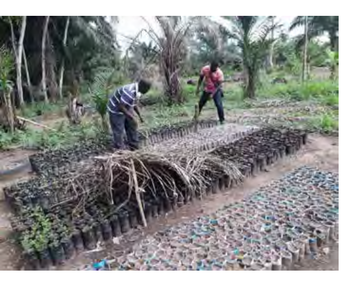
Hundreds of seedlings are grown and will be planted along the Zio river to stabilise its banks.

In 2020, two new Climate Fund projects have been initiated in Togo and Northern Senegal, both focusing on tree-plantings.